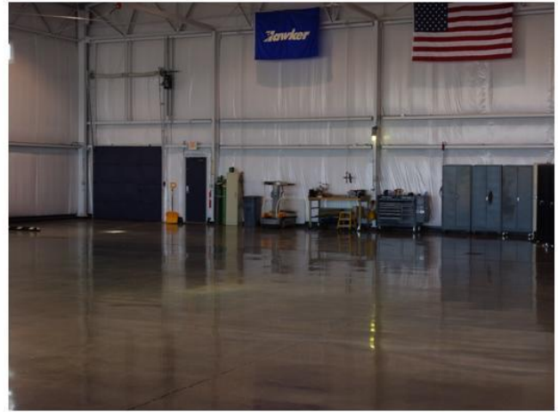
EXECUTIVE DRIVE - THRU