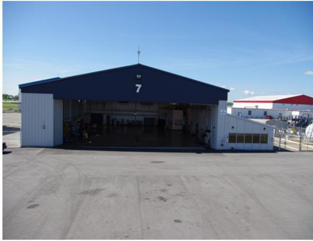
HANGAR 7 - RAMP AREA