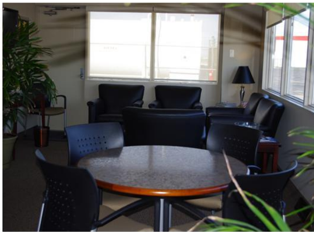
LOBBY - RAMP ACCESS