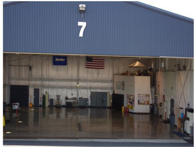
FINISHED HANGAR FLOOR