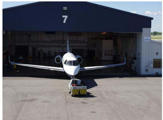
TWO MEDIUM SIZE JETS