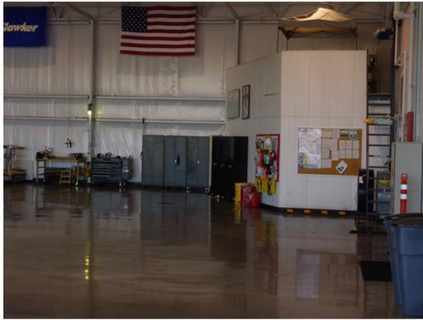
A/C MAINTENANCE OFFICE